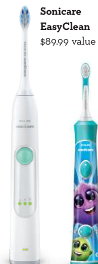
Sonicare EasyClean $89.99 value